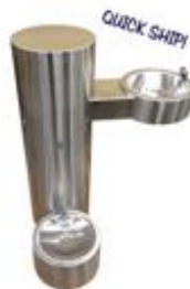
Sample Combination Fountain

Combination Drinking Fountain – Combination fountain for dogs and people, 50% cost share with playground. Parks without dog fountains typically fall back on well-intentioned owners bringing in water bowls, but if left unchecked can be unsanitary and create a breeding ground for mosquitos and undesirable germs.