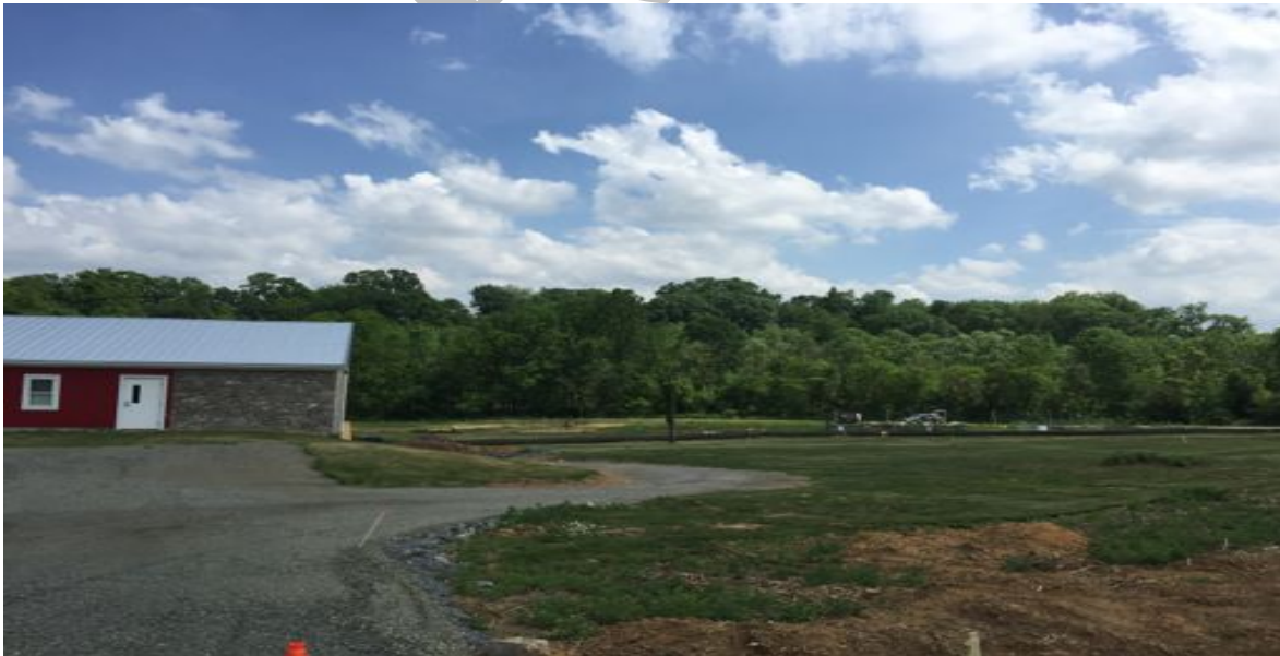
Existing Site Usage

Existing Use – The potential site for the Dog Park is currently a combination of a grassy area and small garden plots being used by the Council of Churches to grow produce for disadvantaged citizens. The site is slightly sloped, with 2 or 3 existing shade trees. A barrier tree line between the site and the PA Turnpike provides both visual and noise abatement.